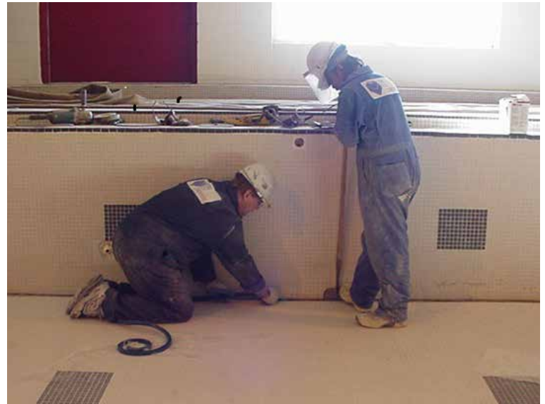
CJ-2020 is a commonly used waterstop for floor-to-wall and corner construction joints for swimming pools.

Hydrotite is intended for use in fresh water environments with small amounts of contaminants. Specific site testing is required in areas with concentrated chemicals, processing fluids and brines.