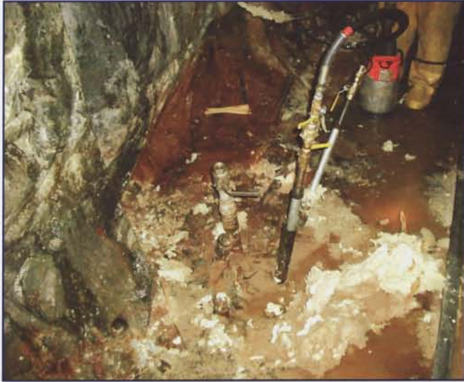
Grout plugs are installed to allow high pressure injection of Multiurethanes Universal Resin.