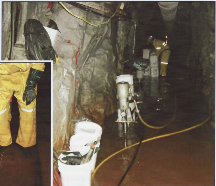
From high volume flowing water to a dry tunnel. Call Multiurethanes when difficult ground conditions are experienced on your jobsite.