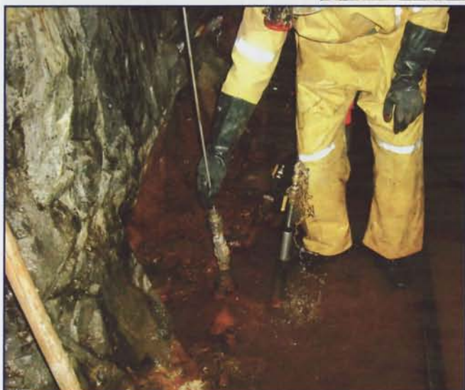
Experienced grouting technicians work together to stop the most difficult water flows.

The secret to this successful water cut-off project was the application of appropriate grouting techniques, equipment and materials for the existing site conditions. After conventional cement