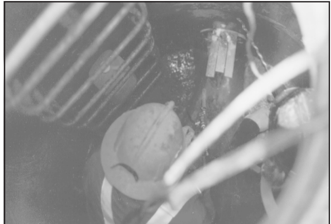
Alexandria, ON Repair of Leaking Manholes

Low-viscosity sodium silicate grouts were widely used for soil stabilization and still are applied on a few occasions where low soil permeability prohibits the use of microfine cements. As indicated above, sodium silicate is used in conjunction with cement grouts to accelerate the curing of cement grouts and to create flash-setting grouts when water inflow conditions are encountered.